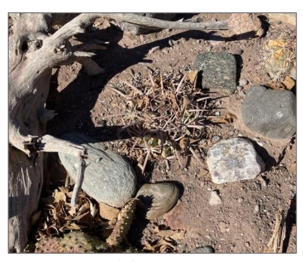
Gary's favorite cactus