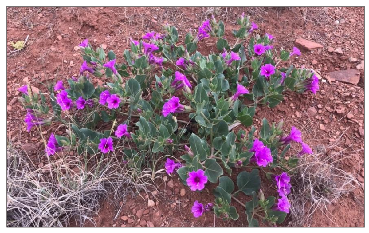
Desert Four O'clock (herbaceous perennial, not a cactus)