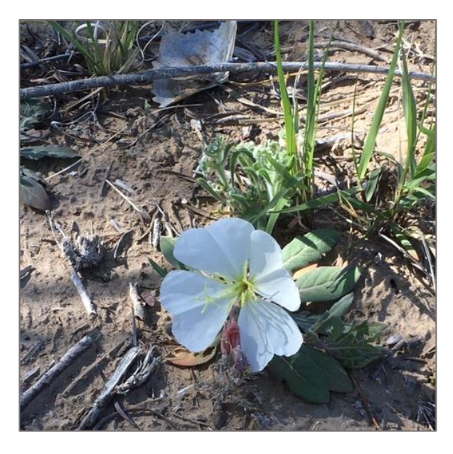
Tufted Evening Primrose or Sand Lily