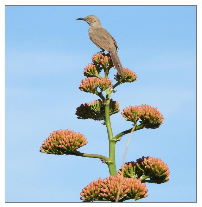
Curve-billed Thrasher