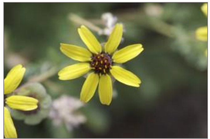
Chocolate Flower