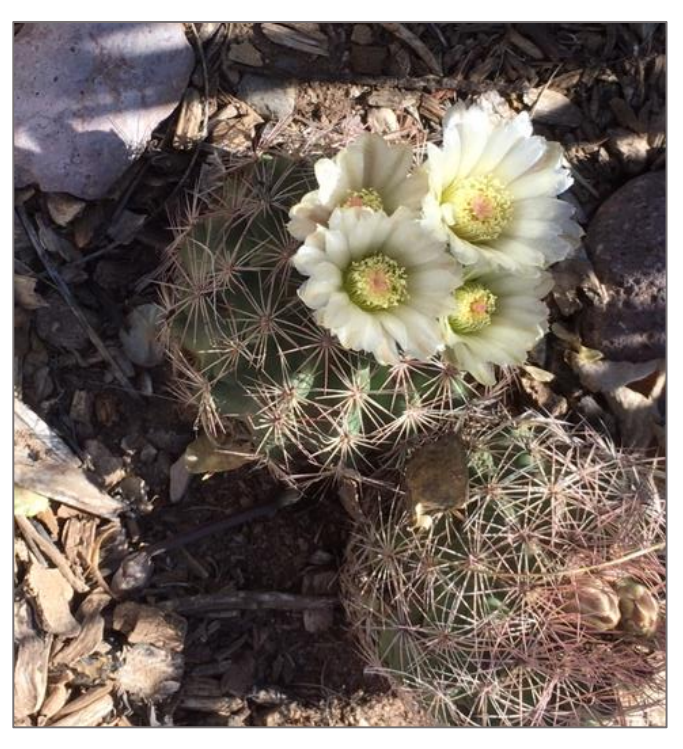
Woven Spine Pineapple Cactus