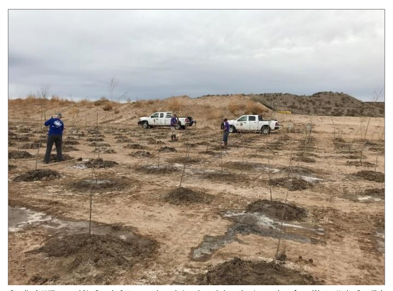
Gooding's Willows and Rio Grande Cottonwoods are being planted along the river at the refuge.

With flood control and channelization projects along the Rio Grande, cottonwood seeds and saplings often fail to find enough moisture to survive. There are many old trees but few young ones in our riparian forests; these saplings must also now compete against non-native and invasive Russian olive and salt cedar.