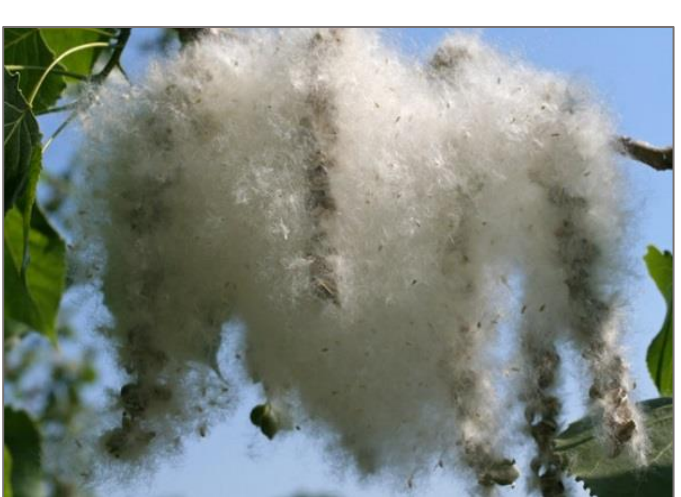
Cottonwood male (L) and female catkins in flower and the seed mass with cotton tufts produced on the female (R)

The seeds on a cottonwood remain viable for only a few days to a few weeks, and must quickly find saturated alluvial soil in which to sprout. If the soil dries too quickly, the seedling dies. Given sufficient moisture, however, the seedling may put down roots extending three to five feet deep in the course of the first summer.