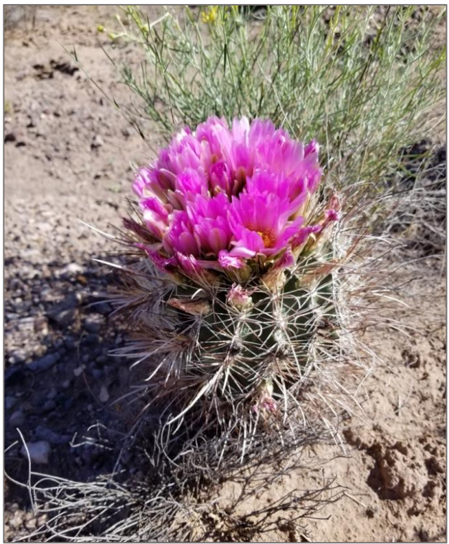
Smallflower Fishhook Cactus, (Sclerocactus parvriflorus) Not common on the refuge. Found in the Four Corners region of NM.