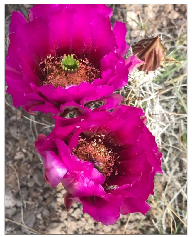
Unidentified cactus, but very pretty!